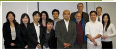
UCI and Waseda University Faculty and Staff

conference on crime, law, and society. This inaugural conference of doctoral students from a leading university in Japan together with UCI graduate students presented research on corporate governance and economic crime; individual lawbreaking; regulation; sanctioning issues; and legal theory and practice. They discussed their work with foreign delegates over a two-day period. The common thread among these presentations was their analyses and implications for comparative and international work in their respective areas.