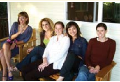
Masters in Urban Planning Students

PPD had a back to school gathering on October 11, at the San Joaquin Wildlife Sanctuary Duck Club. Students had the opportunity to become better acquainted with one another, and meet faculty and community planners. It was a well attended and fun event.