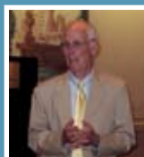
The Honorable Slade Gorton