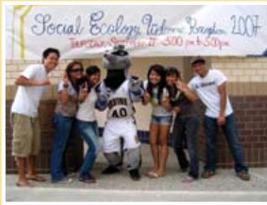
Social Ecology Students pose with Peter the Anteater

had the opportunity to meet representatives from the UCI Career Center, Social Ecology Student Services and numerous faculty, many of whom attended and extended a warm welcome. Everyone participated in prize drawings, enjoyed refreshments, and was given free goodies such as t-shirts, hats, notebooks, and pens.