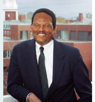
Professor William Julius Wilson

On May 11 and 12, "Inequality: Southern California's Fault Line" Conference will be held at the Beckman Center, co-sponsored by the School of Social Ecology. Professor William Julius Wilson, of Harvard University's John F. Kennedy School of Government, will be